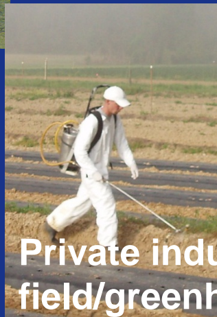
Private industry field/greenhouse research