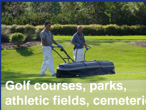
Golf courses, parks, athletic fields, cemeteries