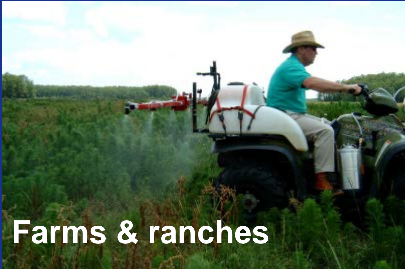
Farms & ranches