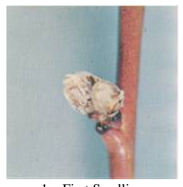
1 – First Swelling