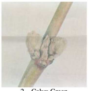
2 – Calyx Green