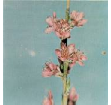
6 - Full Bloom