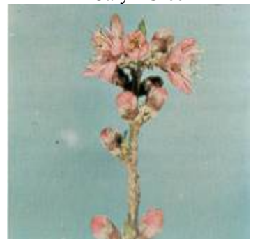
5 – First Bloom