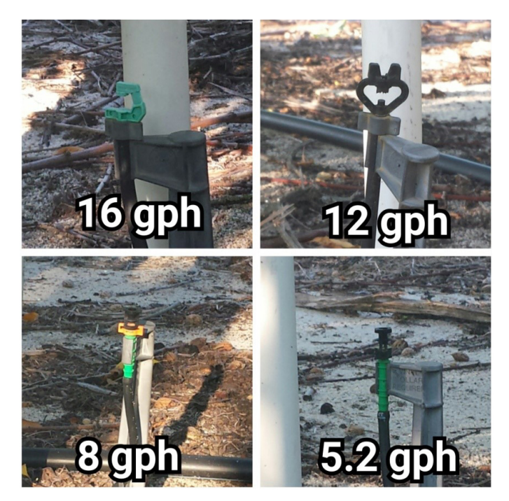
Figure 3. Examples of micro-sprinkler heads used for irrigation in peaches.

Peach trees in Florida are irrigated using micro-sprinklers, usually one emitter per tree. Several micro-sprinklers with different flow rates and irrigation coverage are available in the market (Figure 3). As a general rule, the micro-sprinkler should cover 50% or more of the area under the tree canopy. However, up to 80% irrigation efficiency can be achieved by a well-maintained and managed micro-sprinkler irrigation system (Haman et al. 2005). Growers in Florida commonly irrigate early in the morning to reduce losses due to evaporation or wind, with two or three irrigation events per week. Micro-sprinklers are also used for freeze protection, which has become a common practice for many growers as an alternative to the traditional overhead high-volume sprinklers that growers have to remove for pruning (Figure 4).