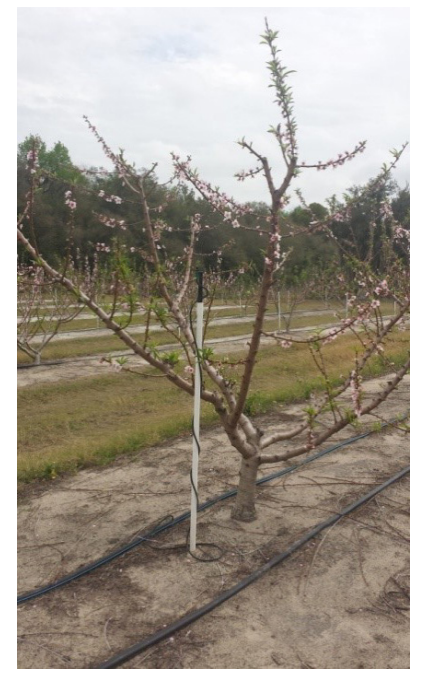
Figure 4. Micro-sprinkler irrigation system used for water supply and freeze protection.