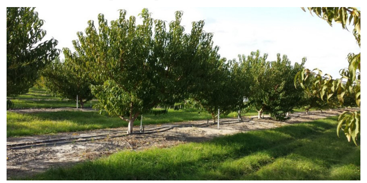
Figure 1. Peach trees in a commercial orchard in central Florida.

This document provides basic information and guidelines on water requirements and irrigation strategies for peaches ( Prunus persica L.) grown in Florida (Figure 1). Several considerations should be made when irrigation is planned for peach production, such as cultivar selection, type of irrigation system, and freeze protection. Irrigation management requires knowledge of soil properties, phenological stages of the plant, rainfall amounts throughout the year, and reference evapotranspiration (ETo).